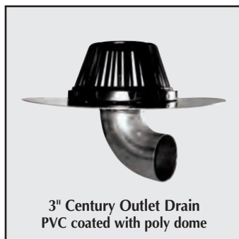
3" Century Outlet Drain PVC coated with poly dome