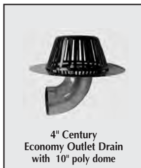
4" Century Economy Outlet Drain with 10" poly dome