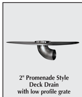
2" Promenade Style Deck Drain with low profile grate