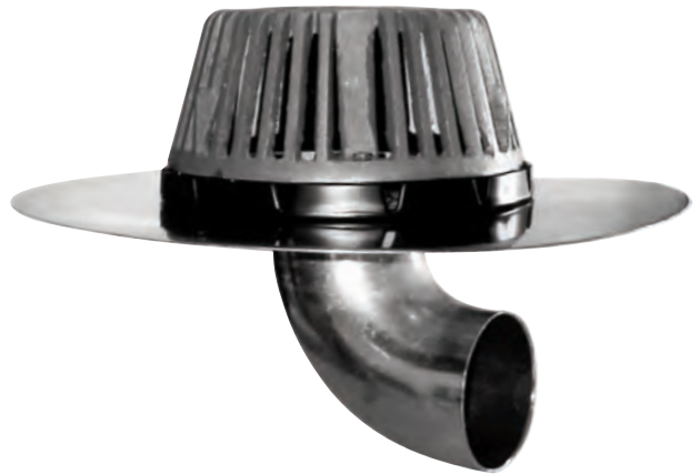
ABOVE: 4" Century Outlet Drain with clamping ring & cast iron dome