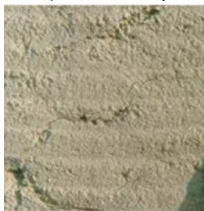
Stucco Mix 1 Tyvek® StuccoWrap®