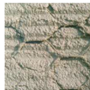
Stucco Mix 2 Building Paper