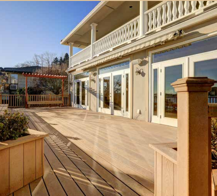
DeckWrap PowerBond is ideal for use with composite wood decking that utilize ACQ-treated structural lumber.

DeckWrap PowerBond is also available in three convenient widths – 3-, 6- and 12-inches – for a variety of applications. Far superior to similar products because of its composition and unique construction, DeckWrap PowerBond is the “must use” product to significantly extend the life of every deck.