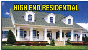
HIGH END RESIDENTIAL