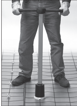
Use the SmartTool standing comfortably