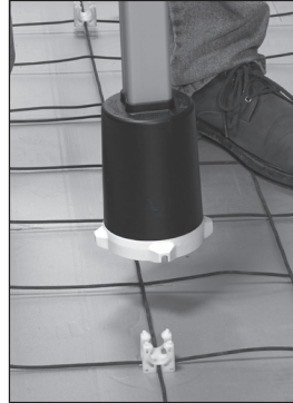
SmartClip is design for a secure 4 point wire connection