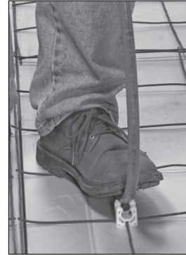
Protective plastic-to-plastic PEX connections