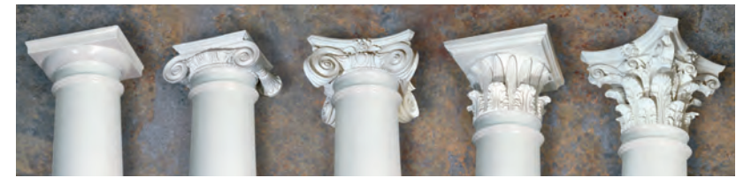
Standard Ionic Scamozzi Temple Corinthian