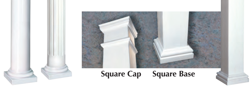
Square Cap Square Base

Round smooth and round fluted columns are complemented by matching classic caps and bases, including the Standard, Ionic, Scamozzi, Temple, and Corinthian caps and Standard and Attic bases (shown above). Square columns are also provided with a matching classic cap and base (shown below).